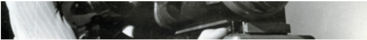
(Photo of Karel Zeman)

We will have some very exciting titles to share with you shortly, titles both new and classic, with many of them linked to this year's theme of "projection". This very rich theme will be explored in several ways. Of course, all cinema is concerned with the act of projecting images onto screens, but audiences in turn also project their hopes and dreams, romances and heartbreaks, onto these flickering big screen images, and onto the characters they contain.